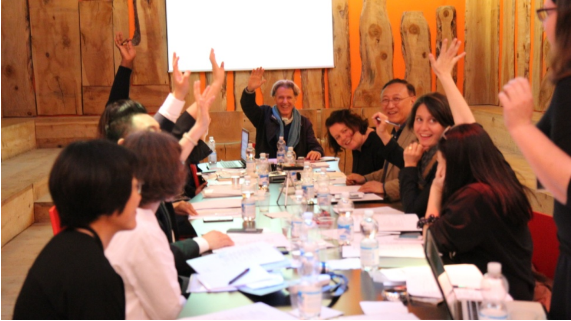
5th Board Meeting, May 30, 2016. Milano Triennale.