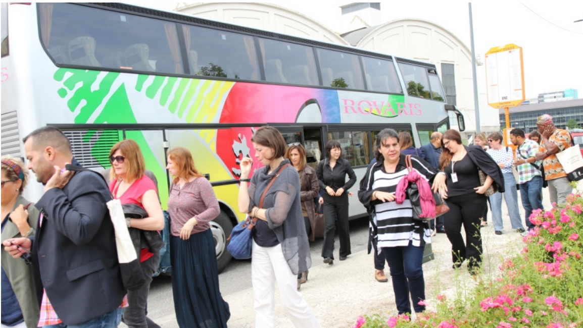
Exhibition venue tour, June 2, 2016. Pirelli HangarBicocca.