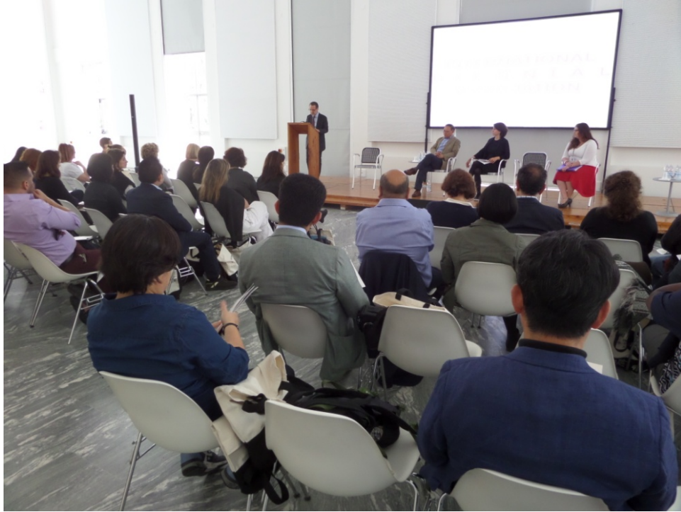
3rd General Assembly, May 31, 2016. Milano Triennale.