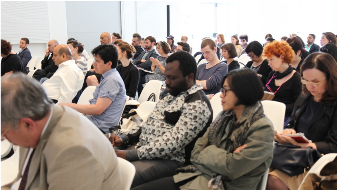
Public Conference at 3rd General Assembly, June 1, 2016. Milano Triennale.