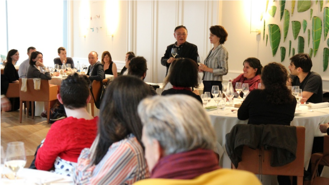
Farewell dinner, June 1, 2016. Mudec, Museum of Cultures in Milan.