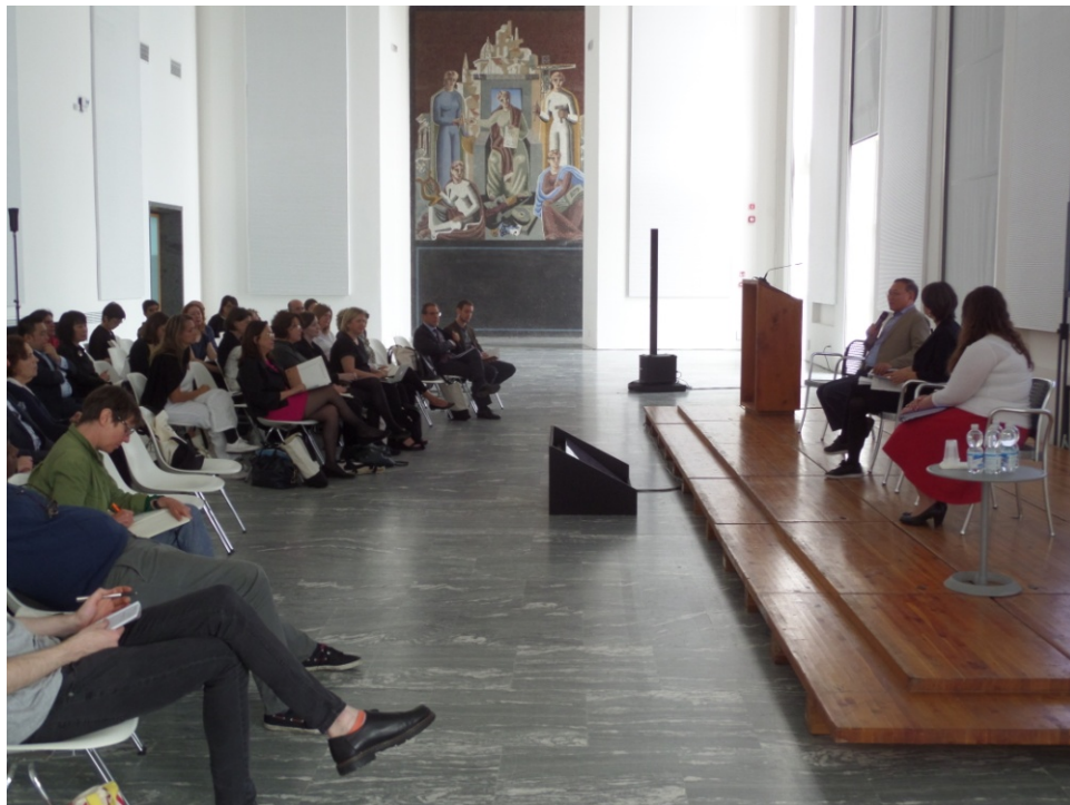
3rd General Assembly, May 31, 2016. Milano Triennale.