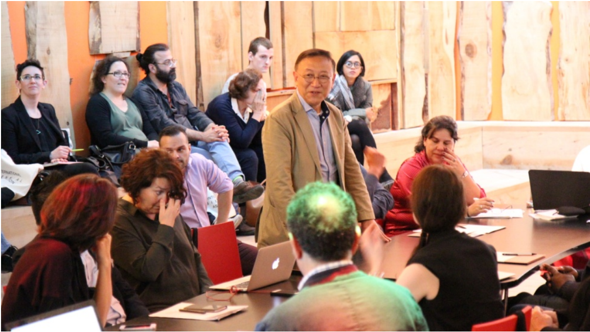
Working Committee meetings, May 31, 2016. Milano Triennale.