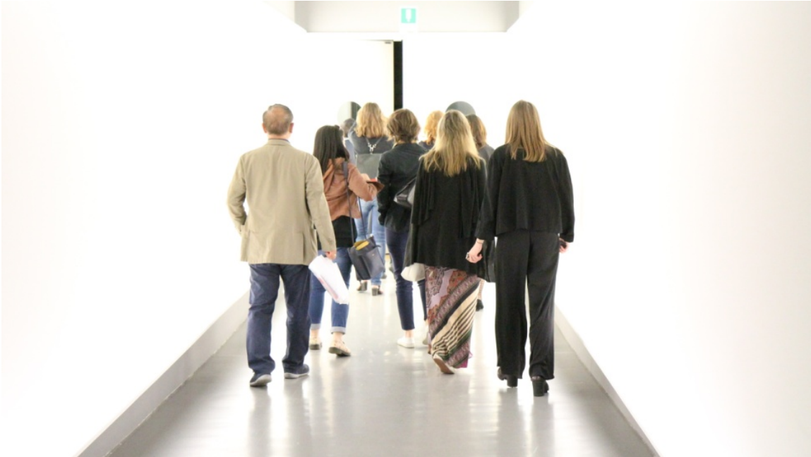
Exhibition venue tour, June 1, 2016. Palazzo dell'Arte.