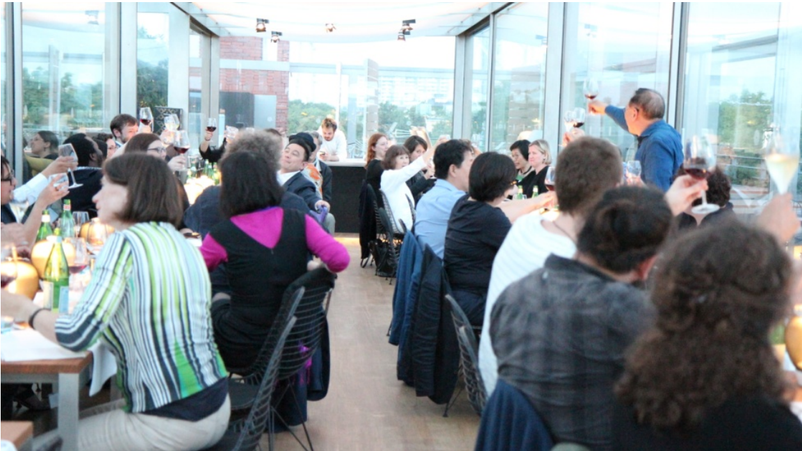
Welcome dinner, May 30, 2016. Terrazza Triennale, Milano Triennale.